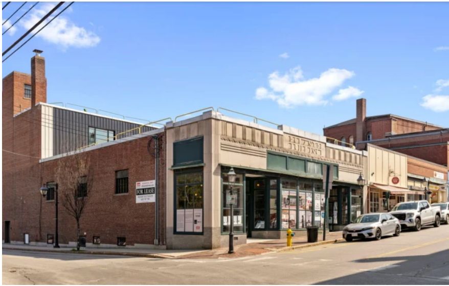
The Grant Building on Centre Street in Bath.

One of Downtown Bath’s largest-ever renovation efforts is nearly finished.